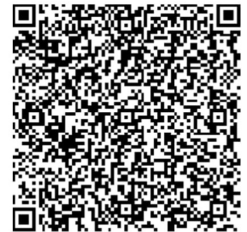
NSS GCW Parade Launches "Diwali with MYBharat" Program to Promote Civic Sense among people

by MK Online Desk Published October 21, 2024