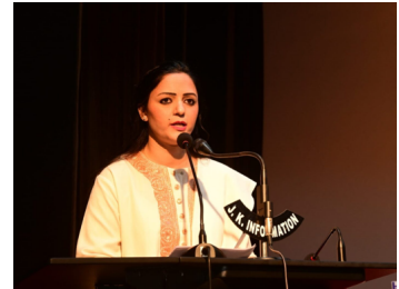
Lieutenant Governor releases Shehla Rashid's book 'Role Models: Inspiring Stories of Indian Muslim Achievers'