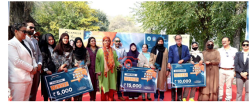
SRINAGAR, OCTOBER 27: In a celebration of strength and heritage, Dal Lake in Kashmir hosted a historic event, the first-ever traditional boat race for women, organized by JKARS.

The India premiere promises to be a star-studded event, celebrating not only the film but the unique partnership between the Indian and Australian film industries. My Melbourne will premiere in the Gala Section of MAMI 2024 on 22nd October, marking a significant milestone in this cross-continental cinematic journey.