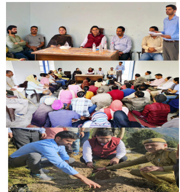
Model Panchayat project: DC Kishtwar Steers Awareness Initiative, Evaluates Developmental Milestones at Badhat